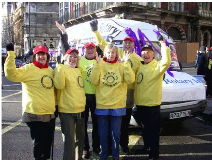
District Governors braving the cold D1130.D1240 D1250,D1260