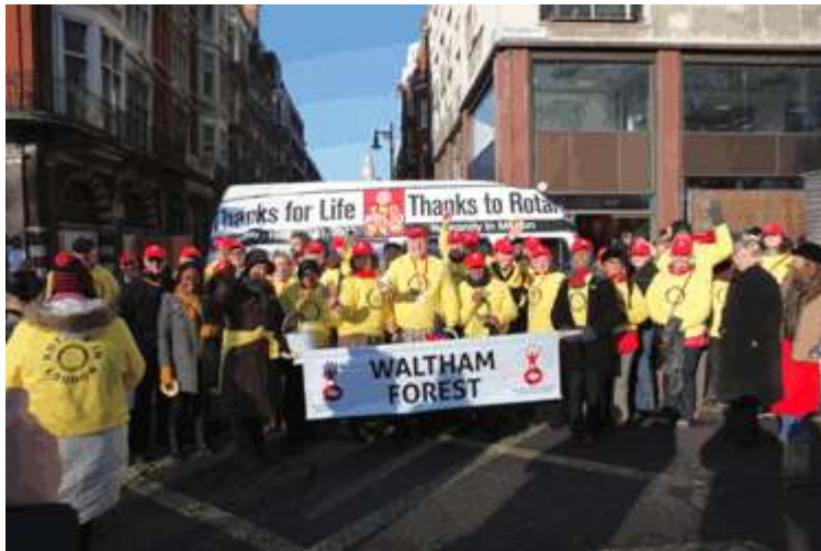
Most of Team before the New Years Day parade started